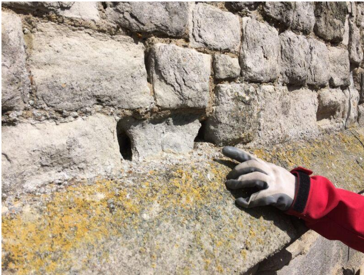
Disappearing mortar and stone